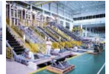
The escalator line produces 1,000 units a year.