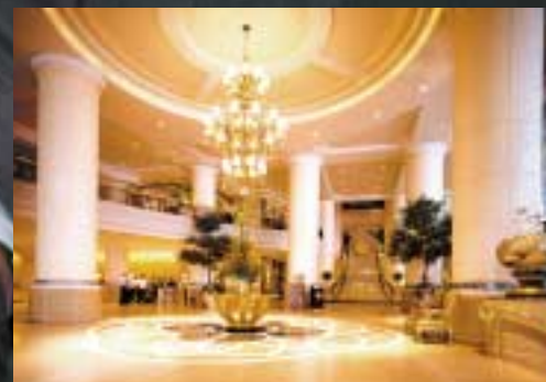
Le Royal MERIDIEN Bangkok Hotel