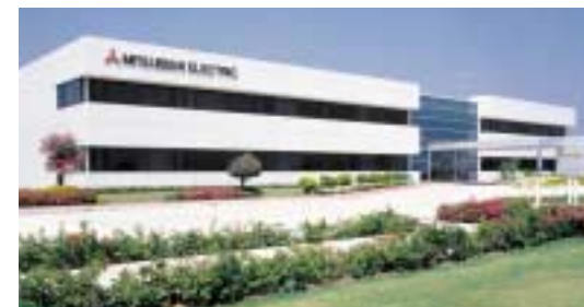
The AMEC plant is the largest elevator and escalator factory in Thailand.

AMEC (Mitsubishi Elevator Asia Co., Ltd.), celebrating its tenth anniversary, and WIC (Worachak International Co., Ltd.) are proud to hold the top level market share in Thailand. AMEC's huge factory covers 160,000m 2 and employs 670 staff. Production began in June 1992, and in the fall of this year the total number of units produced will exceed 20,000. Concentrating on standard-type elevators and escalators, the export ratio is 90% and growing every year. The export destinations include 55 different countries in Europe, the Middle East, South Africa, China, Southeast Asia, South and Central America. Our business support system, Darwin, an internet technology that offers real-time data communication between Japan and Thailand, realizes total system management from order to shipment. This quick-response system greatly expedites delivery. The AMEC factory was recognized as "excellent" by the Thai Board of Investment, and was chosen as the best factory by the Thai Industrial Housing Complex Management Bureau in 1993. In January 2002, the factory will begin production of the new machine-room-less elevators that are packed with the world's most advanced technology. AMEC is to supply all 254 escalators to the new Bangkok subway system (MRTA), further proof of the factory's widely recognized quality and its commitment to the Thai community. For 10 years, AMEC has been exporting five-star quality to the world. That's pure Quality in Motion.