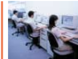
Our internet system Darwin expedites every stage of production.