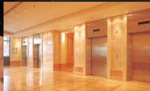
Elevator hall boasting sophisticated design.