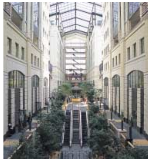
Spacious atrium running along Fox Street.