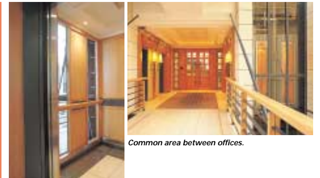
Common area between offices.

The second phase of the Nedcor Precinct Development, Finance Square Sandton, is located next to the Johannesburg Stock Exchange on Maude Street, the most prestigious address in South Africa. It offers office floor space of 20,000 square meters, with an additional 20,000 square meters for retail applications. The building's nine office floors are served by six high-speed Mitsubishi elevators. On completion of the third phase, the entire Nedcor Precinct will comprise four "L" shaped buildings on either side of the street abutting two large landscaped parks. State-of-the-art features will include a 230-seat auditorium, 18 general meeting rooms complete with the latest teleconferencing facilities, a staff restaurant for 375 diners plus eight dining rooms, and a total of 38 Mitsubishi elevators.