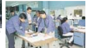
Some of the factory's skilled staff.