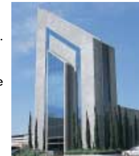
The plant's test tower is a stylish piece of architecture.

In addition to high-quality manufacturing, the company is also highly acclaimed for its excellent installation, maintenance and after-sales service.