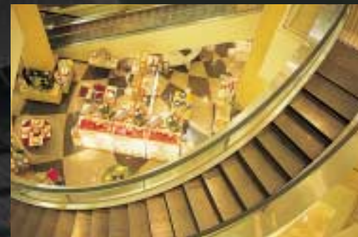
Some customers come just to ride the unique escalators.