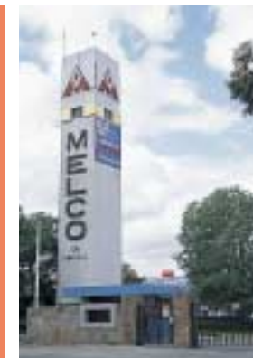
The entrance to Melco de Mexico's plant in San Juan del Rio, Queretaro.