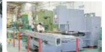
State-of-the-art technology ensures quality.