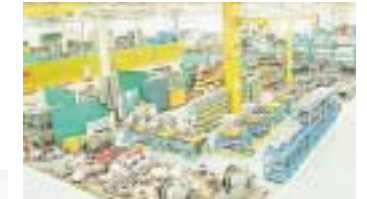
The elevator production line.