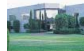
The main administration block at Tlalneantla.