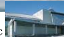
The new Villa 17 includes an ELENESSA elevator

Dating from the Jin Dynasty over 800 years ago, the Diaoyutai, or "Angling Terrace," was an imperial vacation residence for centuries. In 1959, the exclusive compound of lakes and gardens was transformed into the Diaoyutai State Guesthouse for visiting foreign dignitaries. The compound boasts 18 separate villas, multipurpose convention halls, and a range of luxurious facilities such as a swimming pool, indoor tennis courts, fitness rooms, saunas, etc. The Diaoyutai is also famous for its banqueting rooms and the gourmet cuisine prepared by its chefs. In addition to five GPS-III elevators and two dumbwaiters, Mitsubishi has supplied Villa 17 with the new ELENESSA machine-room-less elevators.