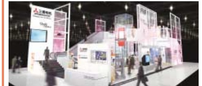
The Mitsubishi booth at China World Elevator 2002

Our booth in Hall 11 will show an actual ELENESSA elevator and A-type escalator, as well as informative displays on our MEL ART II technology, ΣAI-2200 system, etc.