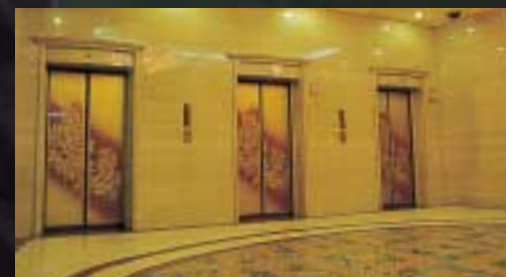
Korean art decorates the elevator doors.

Mr. Lee Dong-Ho of the Lotte Jamsil Hotel, Seoul, Korea, is very proud of the Mitsubishi elevators and escalators installed in the hotel. "The hotel features two spiral escalators, the only such escalators in Korea!" Combining a deluxe hotel with an adventure theme park and luxury shopping mall, the Lotte Jamsil is an urban resort. Mitsubishi and Lotte collaborated to customize the transport system to suit this unique project – including spiral escalators, observation elevators, Korean artwork within the designs, etc. "The hotel image was actually enhanced by the choice of materials used in the elevator designs. That's something that was only possible with Mitsubishi's superior design sense." The choice of Mitsubishi products was based on safety, design, technology and reliability. "Elevators and escalators are the most important transport systems in the hotel, and passenger safety is paramount. We were also concerned with design renewal. Lotte knew that Mitsubishi has the best technology in the world, and also the best reliability in the world. And Mitsubishi realized that Lotte is an extremely important client. Mutual trust is why Mitsubishi elevators were installed in this hotel. That's the only reason, I think." Proving that this trust continues today, Mitsubishi and Lotte are currently collaborating on another Lotte World Hotel in the southern resort town of Pusan. "This will be a new landmark for Korea, a world-class hotel and urban-leisure resort."