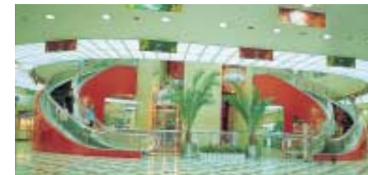
The Jamsil's two spiral escalators are the only ones in Korea.

Opened for the Seoul Olympics in 1988, the Hotel Lotte World offers over 500 guest rooms, 12 restaurants and bars, 6 meeting rooms, indoor golf, sauna, etc. Overlooking the Han River, this unusual "resort-style business hotel" combines leisure, business and shopping facilities under one roof. To suit the unique building, the transport system features many unique touches: the only two spiral escalators in Korea; stylish observation elevators; and customized car ceilings and fittings.