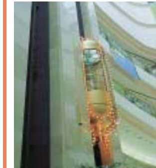
Illuminated indoor observation elevators add a thrill to travel.